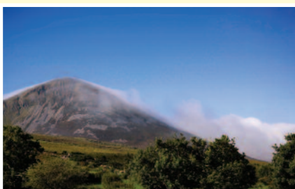
Croagh Patrick, Westport.