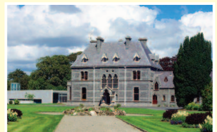
National Museum of Country Life. Fáilte Ireland.