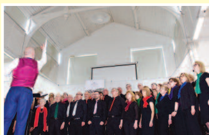
Choir singing in St. Mary's Hall, GMIT Mayo Campus.