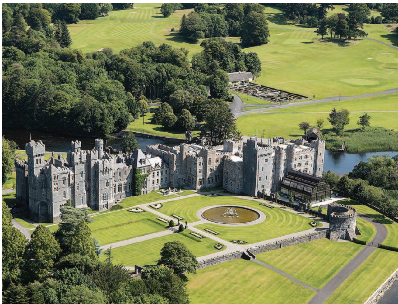
Ashford Castle.