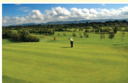
Golfing at Ballina.