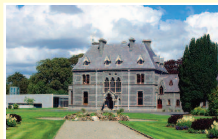
National Museum of Country Life. Fáilte Ireland.