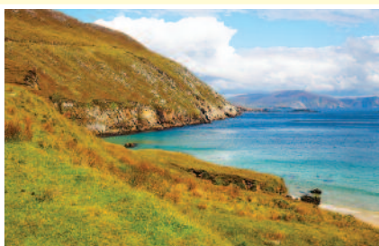
Achill Island on the Wild Atlantic Way.