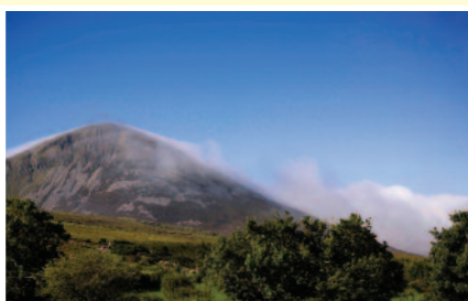
Croagh Patrick, Westport.

Immediately! The better-quality and better-value hotels tend to book out months in advance. For choirs wishing to take part in competitions, these are held on Saturday from early morning, so if travelling more than 30km from Mayo, we strongly recommend to book Friday and Saturday nights, at a minimum, as soon as the choir decides to participate in the festival. Some hotels may accept a provisional booking and we highly recommend to avail of same. In summary, to avail of the most comfortable and the best-value-for-money accommodation, and to avoid limited availability and possible high rates closer to the festival dates, please book your accommodation as many months in advance of the festival as possible.