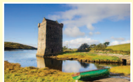
Rockfleet Castle.