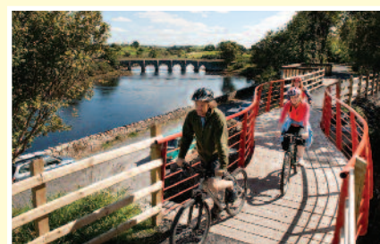
Great Western Greenway.