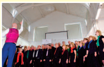
Choir singing in St. Mary's Hall, GMIT Mayo Campus.