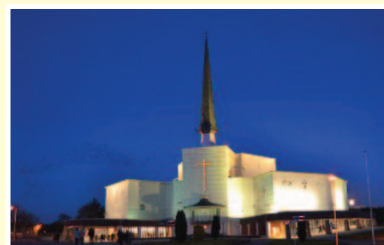
Knock Basilica.