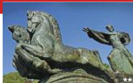
Sculpture of Manannan, The Mall, Castlebar