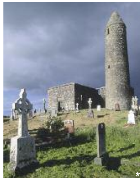
Turlough Round Tower