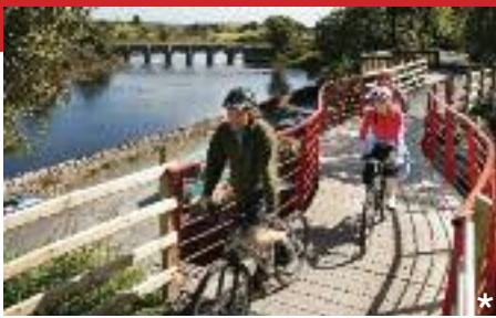
The Greenway, Newport/Mulranny