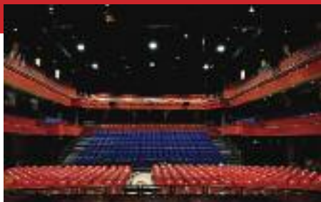
Royal Theatre, Castlebar