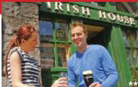
Enjoying a 'Pint'