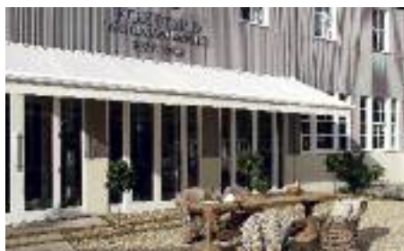
Foxford Woollen Mills ▲