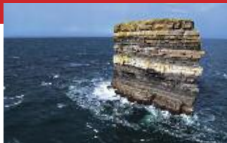
Downpatrick Head, Ballycastle