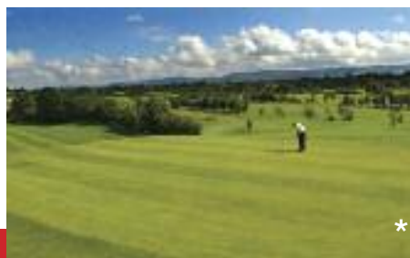
Golfing at Ballina