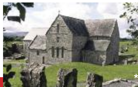
Ballintubber Abbey ▼