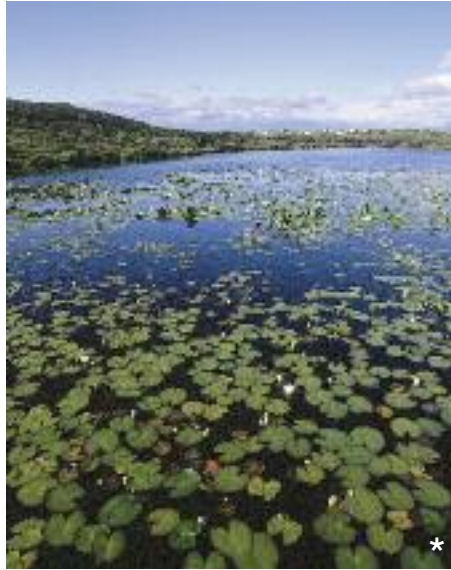
Lough Conn, Pontoon/Ballina