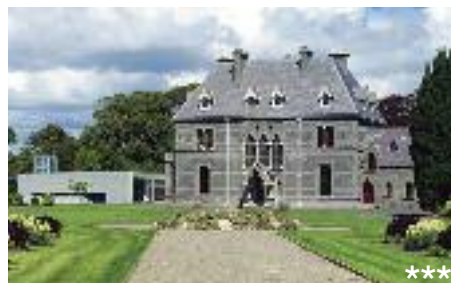
National Museum of Irl. - Country Life, Turlough ▲ Achill ▼