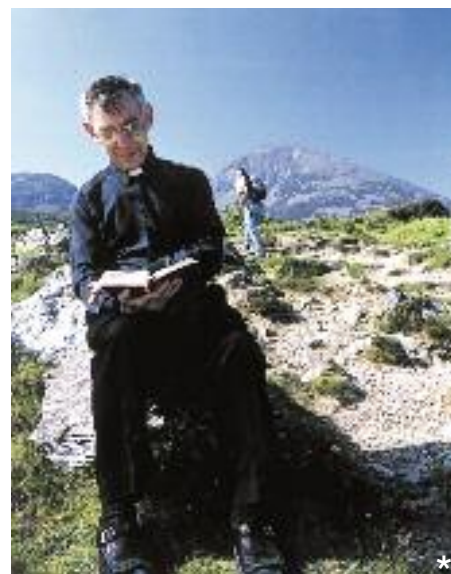
Priest at Croagh Patrick

Account Name: Mayo International Choral Festival. Bank: BANK OF IRELAND. NSE: 903744 Branch Address: CASTLEBAR CO MAYO Account No.: 81600939 IBAN No: IE70 BOFI 9037 4481 6009 39 BIC NO: BOFIE2D