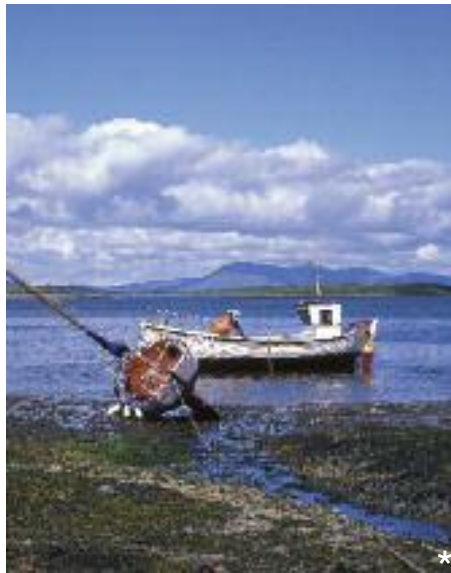
Bertra, Clew Bay