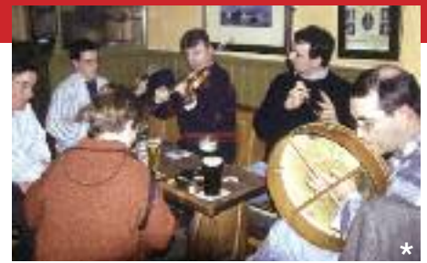
Traditional Music Session